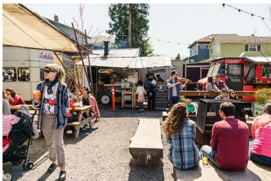
Tidbit Food Farm

hoarders ( 3225 SE Division St., littleotsu.com ) and nearby art gallery Nationale ( 3360 SE Division St., nationale.us ).