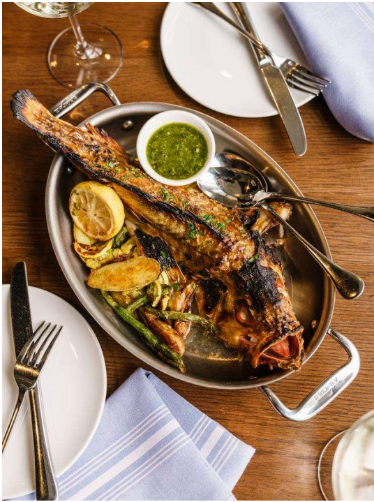
The whole roasted thornyhead fish at Headwaters restaurant at the historic Heathman hotel.