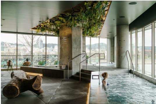
SOAK IT ALL IN Knot Springs spa, with its various hot and cold pools, overlooks the Willamette River.

9 a.m. After two nonstop days, you've earned a little R&R. Report to the new Knot Springs spa first thing in the morning for a Thai massage. Plan to spend time before or after the massage in the pools, where floor-to-ceiling windows overlook the river and the city skyline ( book a week in advance; 33 NW 3rd Ave., knotsprings.com ).