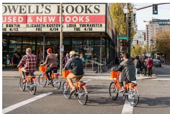
ON THE OREGON TRAIL Bike-share riders pass by Powell's, one of the country's largest bookstores.

3 p.m. Stroll around the Pearl District, a former warehouse zone turned stylish retail destination, and pop into Hunt & Gather , an art and home goods store (1302 NW Hoyt St.; huntgather.com ) and MadeHere PDX , which features only locally made items, from leather bags to cooking skillets (40 NW 10th Ave., madeherepdx.com ).