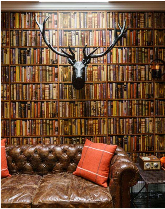
The Sentinel Hotel.

hopping on the Metropolitan Area Express (MAX) train. It's a 40-minute ride into the city to the cheap-and-cheerful Society Hotel , housed in a recently reclaimed 1880s lodging house ( from $135 a night for a private room, thesocietyhotel.com ). For more luxurious digs, ride the MAX 10 minutes farther to Sentinel Hotel , an elegant mash-up of two historic buildings ( from $185 a night, sentinelhotel.com ).